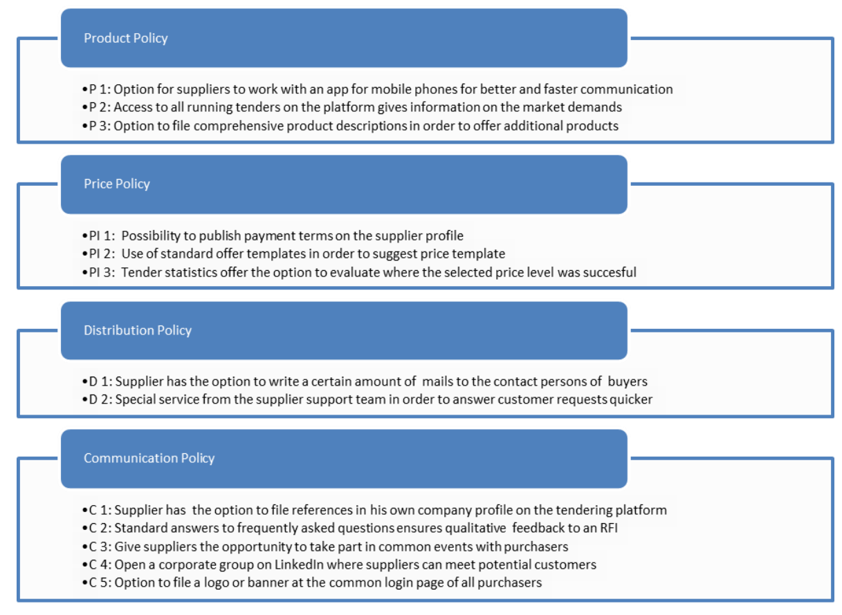
Figure 3: Derived Marketing Options.

Based on the provided interview guideline, fifty selected contact persons at suppliers were asked about their willingness to use the suggested features for the marketing activities of their companies.